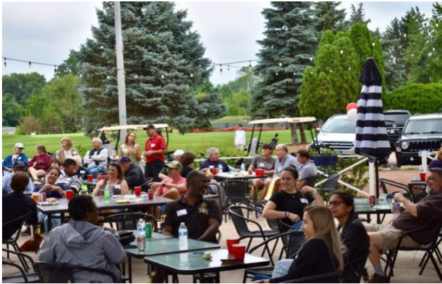
A Look At Some Of The Attendees