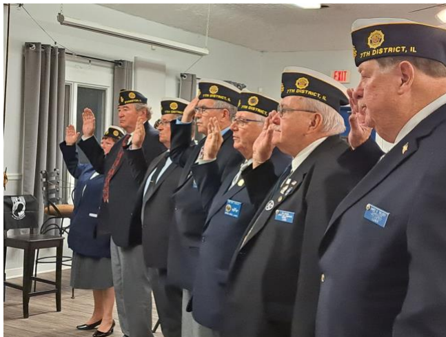
7 th District Officers

Peace & Love this upcoming holiday season,