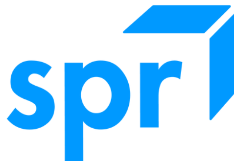
*Member Post 42