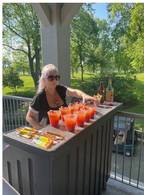
Bloody Mary bar at the Charitable Foundation Golf Outing June 13.