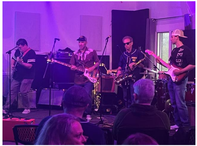
SAL members play during the 2nd Annual Music Fest at the Post 42 Hall June 1.