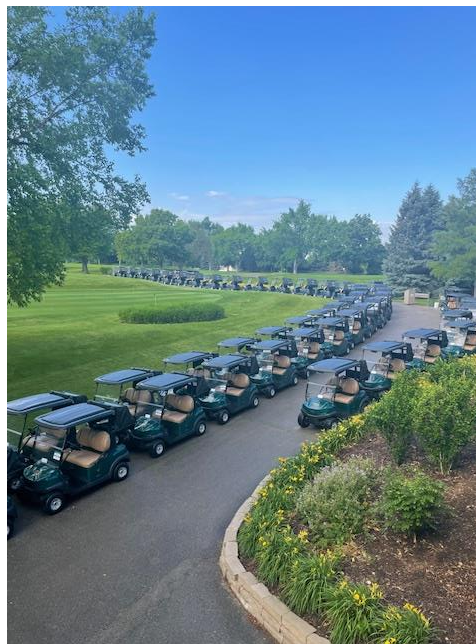
Golf carts waiting for the start of the Charitable Foundation Golf Outing June 13.