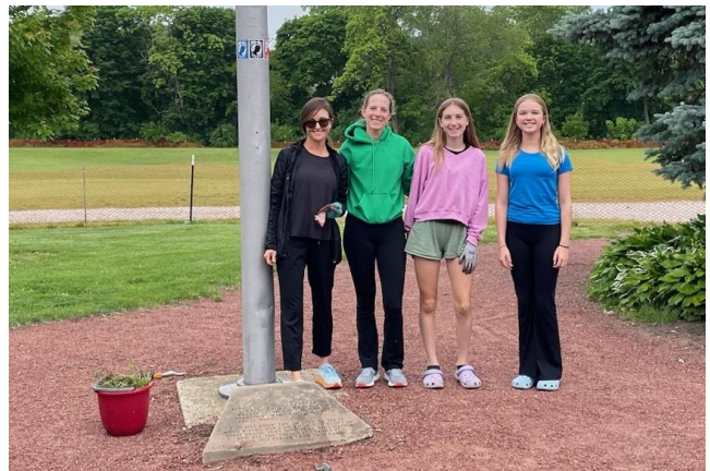
National Charity League members at Post 42 pose for a photo June 1.