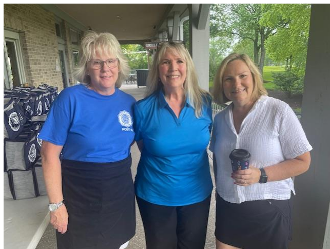
Volunteers at the Charitable Foundation Golf Outing June 13.