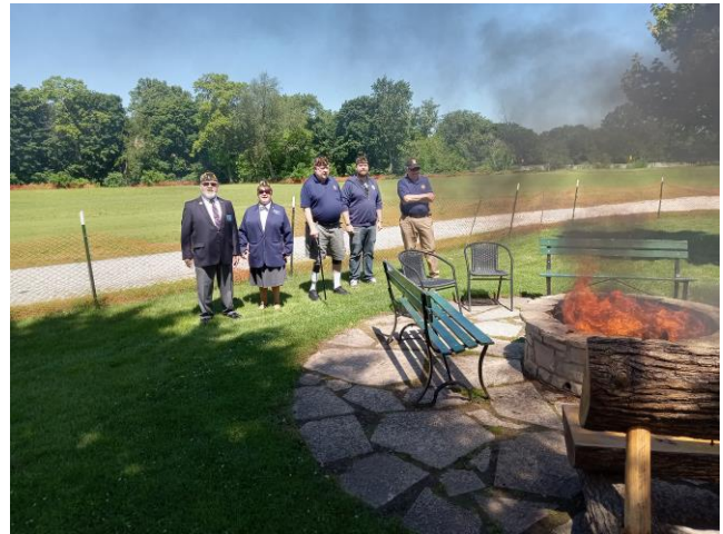
Members of Post 42 observe as US Flags are retired during the Flag Retirement Ceremony June 9.