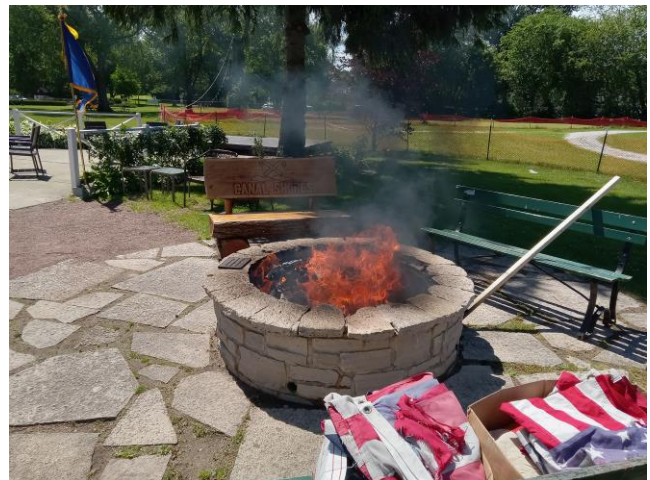
Members of Post 42 observe as US Flags are retired during the Flag Retirement Ceremony June 9.