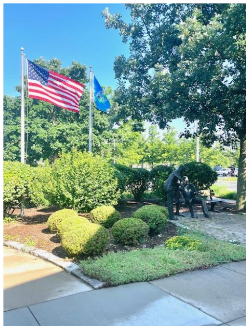
Bloomington Golf Club at the start of Golf Outing June 13.